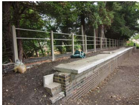
Left: The project to renovate the site of Wheathampstead station is a good example of what can be achieved with the help of enthusiastic volunteers

The 'Railway Project' is a good example. There are now up to 50 different people who have been involved. This project is probably one of the most ambitious things that we will tackle as a community and it is very encouraging that there are so many people wanting to help. WDPS feel that we need to embrace this enthusiasm and not lose the momentum. Those involved with this project have been introduced to many more people in the village and one gets a strong feeling of a community spirit which brings people together.