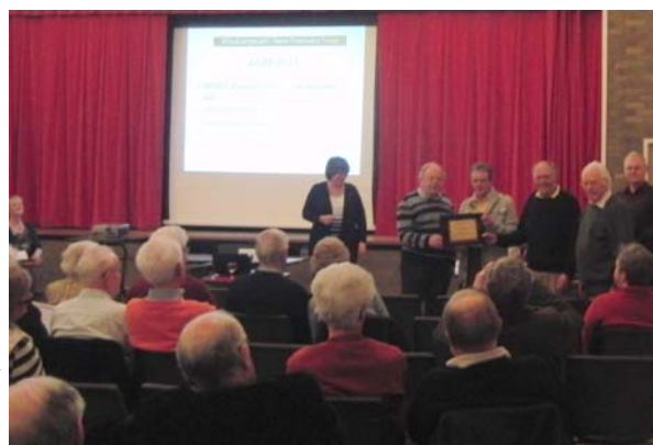
The Station Project Team receive their award.

These are designed to acknowledge the contributions that so many local people make to conserving what is best about Wheathampstead, to making sure that new projects are sympathetic to what already exists and—in short—to making our village all the richer.