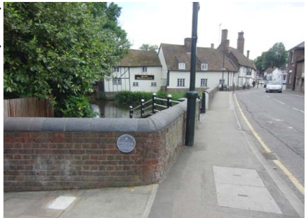
A demonstration plaque about the River lea at Mill Quay

The first phase of the Heritage Trail covers the centre of the village. A route is being devised to take the walker past as many sites of interest as possible. Plaques will be erected on around 20 buildings and structures, each with a short description of what makes the site interesting. Leaflets will be available showing the route and providing extra background information. An interpretation board will be erected displaying the route and other useful information. And a new website has been created which when it is complete will contain more detailed information about the Trail.