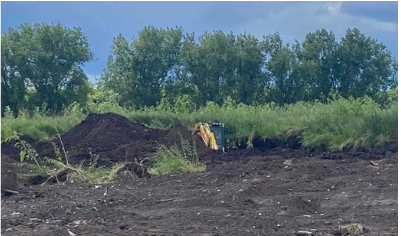
The photo shows the extent of the earthworks, deep enough that a large digger was almost entirely below the level of the surrounding land

In recent months, however, many sightings have been reported of earth-moving activity on the site. This is potentially dangerous as it can expose or dislodge noxious material and it increases the risk that contaminants could leach into the water table.