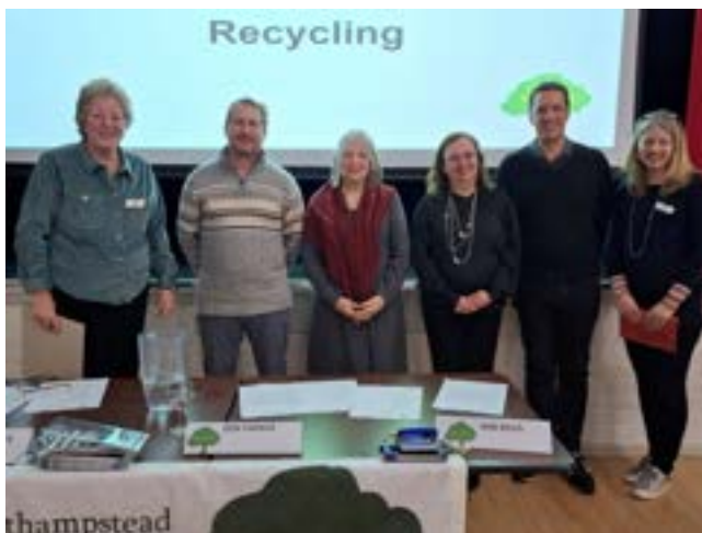
Left: Community Award nominees. Right: Preservation Award nominees

We this year reintroduced the practice of making awards to individuals and organisations in the village. The members who were present voted to choose the winners. The Community Kitchen won the Community Award, and Wheathampstead Chapel Community Hub won the Preservation Award for preserving the former chapel in Brewhouse Hill.