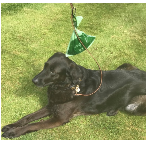
A DooKee holds the poo bag and hangs from the dog lead.

Re-usable Pocket Ashtrays – following the success last year we are bringing back the small re-usable pocket ashtrays because the biggest source of microplastics in the oceans is cigarette filters!