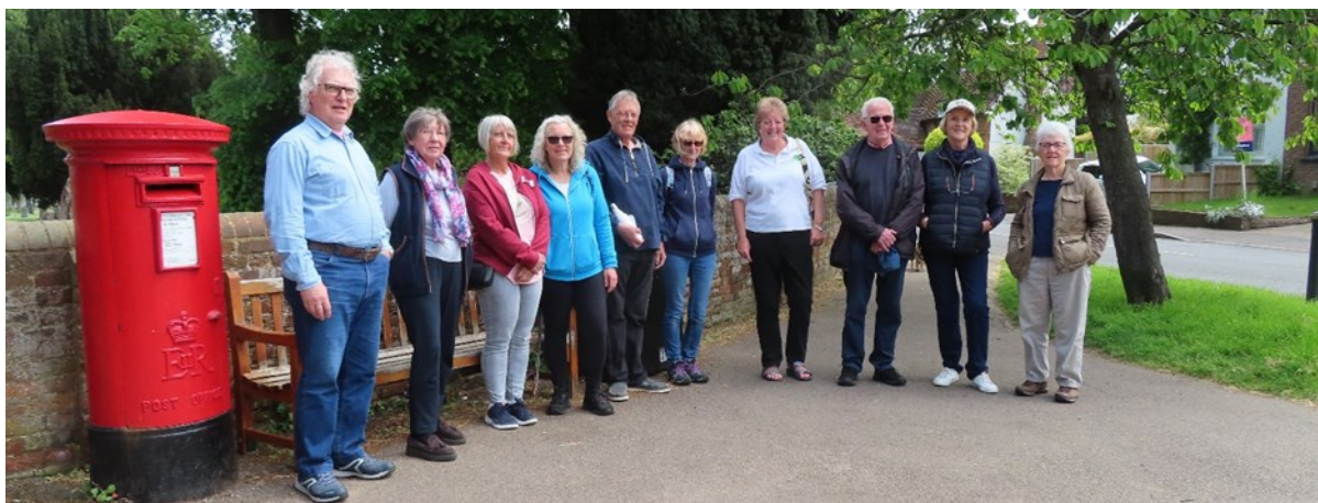
Above: The walking tour pauses by Mill Quay . . . poses at the end of a fascinating afternoon.

Both walks were very popular, and members were surprised about how many interesting facts about Wheathampstead they had been unaware of.