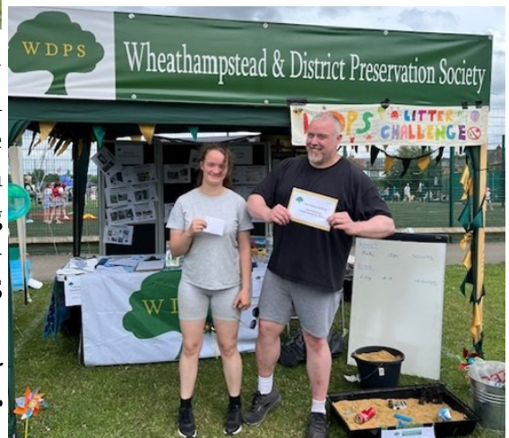
Right: The happy winners of the litter picking challenge

Some people had never used the long reach litter grabbers before, so we were delighted by their enthusiasm to collect ten pieces of litter in the quickest possible time from our pretend beach. We hope that the fun experience will boost the numbers of litter picking Wombles around the village, and we were also extremely happy to sign up a number of new WDPs members.