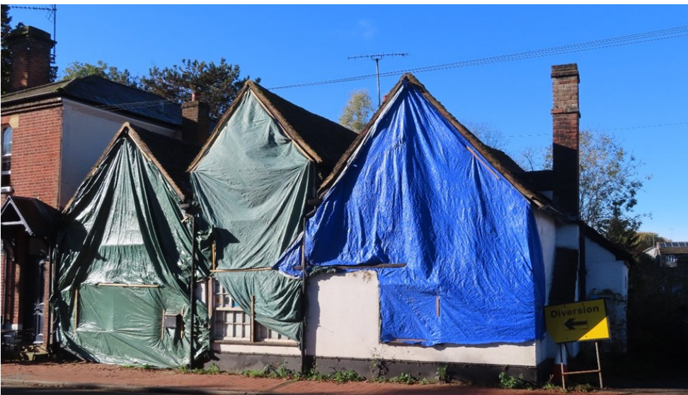
The Old Bakery now (left), as it was after damage occurred to the pargetting earlier this year (below left) and as it was in 2020 (below)

The owners of the property are no doubt eager to sell it. Longer-term plans for the site have been discussed with Wheathampstead Parish Council but are still in the early stages of formulation. It is most likely that the Old Bakery, which is within the flood plain, will remain in commercial use when it is finally re-occupied.